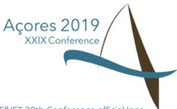
EfVET 28th Conference official logo

EfVET Portuguese National Board is waiting for you in Azores 2019