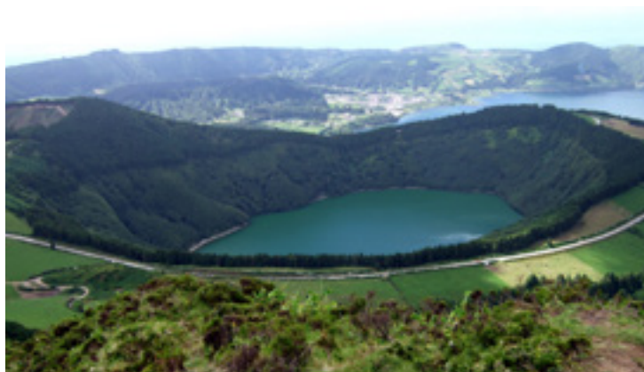
Sao Miguel Island, Sete Cidades Caldera, Lagoa de Santiago, Azores